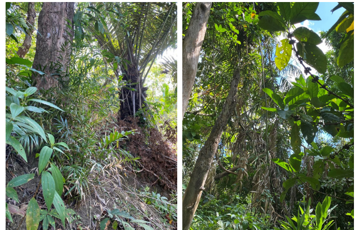
Figure 1. Rattan

One of the main goals of this work is to create a compilation of the NTFPs found in studies that are used in craft production. Below is an index of the various plants identified during fieldwork. Each listed plant is presented in its common name, and locality-specific name, as well as short descriptions of its physical traits and uses when available.