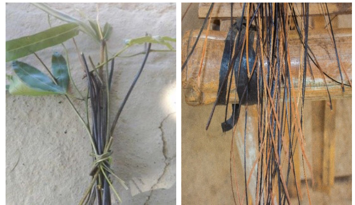
Figure 11. Raw Nito (left) and dried Nito (right)

Puob Buri: The mature Buri trunk is allowed to decompose over several years. Once the internal part becomes soft and broken down, it is used as an organic fertilizer for vegetables.