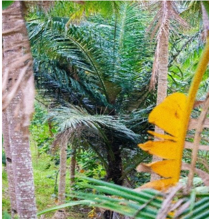
Figure 9. Buri's palm.

Description: Anahaw is mostly used in both households and for business purposes. Its leaves are used as roofs in community homes and businesses. The husks of anahaw are being dried up and are made into strainers. Local market-sourced products made from this multi-purpose plant such as a fan (pamaypay in local terms).