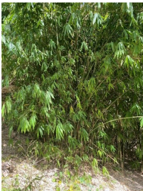
Figure 4. Bagakay (bamboo)

Location: Calibang, Ether, Tanawan, Sinugbuhan