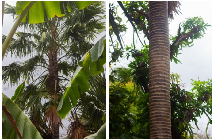
Figure 6. Anahaw