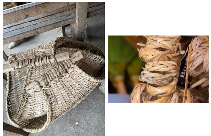
Figure 2. Hammock made of rattan(left) and looped rattan (right) used for a broom made of palm leaves midribs