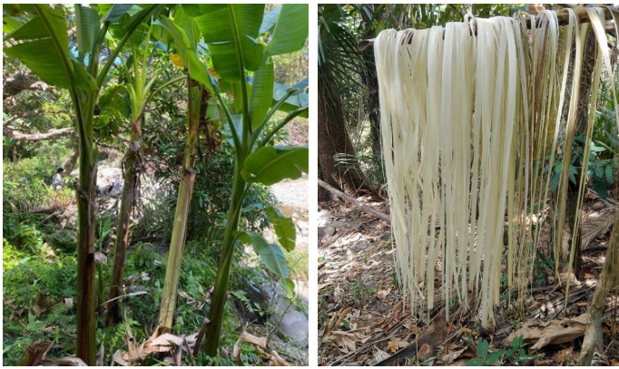
Figure 13. Abaca