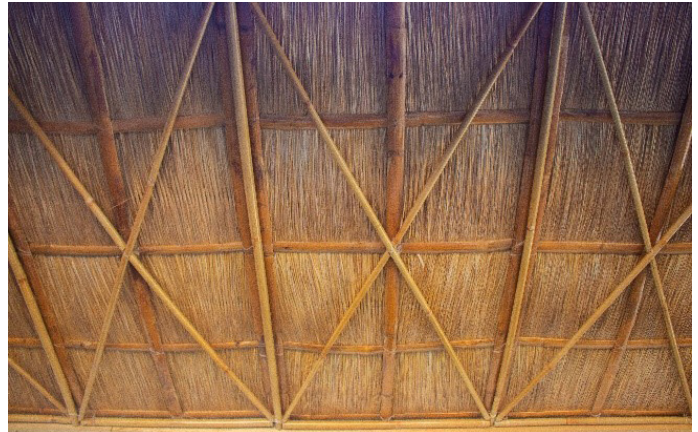
Figure 5. Bagakay used as a roof frame

Description: Rattan, yantok and uway can be interchangeably used locally. It is used to make cradles, bags, chair baskets, and more. When it is split with a knife, it is called rattan, and it becomes clean and usable as rope. It is also used as rope in building huts. It is a strong tool used by the natives. Rattan is used in strips that contribute to the structure of hard-body woven items such as baskets, hammocks, winnower, storage boxes, and plates (Nito). Despite being used as flat strips measuring around ~1-1.2 cm in width, their integrity is utilized in making basket bases and frames.