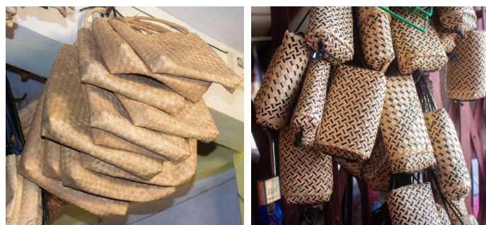
Figure 10. Some of the products made of buri