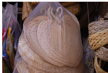
Figure 8. Fan (Pamaypay) made of young anahaw leaves captured from one of the handicraft stores in Mansalay