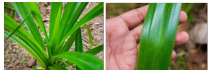
Figure 12. Pandan plant and leaf.

Description: Nito is like a cherry on top of woven products. It serves as a decorative piece as it adds to the attractiveness of finished woven materials made from other raw materials such as buri. Its finished products include bags, pencil cases, wallets, and baskets. Traditionally, locals used it in catching bats. Its roots are used for medicinal purposes as it is being boiled for and drank up. Local weavers used it as a material for weaving through sun-drying. They sank it in the water to easily bend the material.