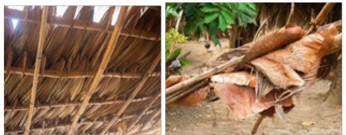
Figure 7. Anahaw leaves are used as the roof (left) and husks(right) as a strainer.