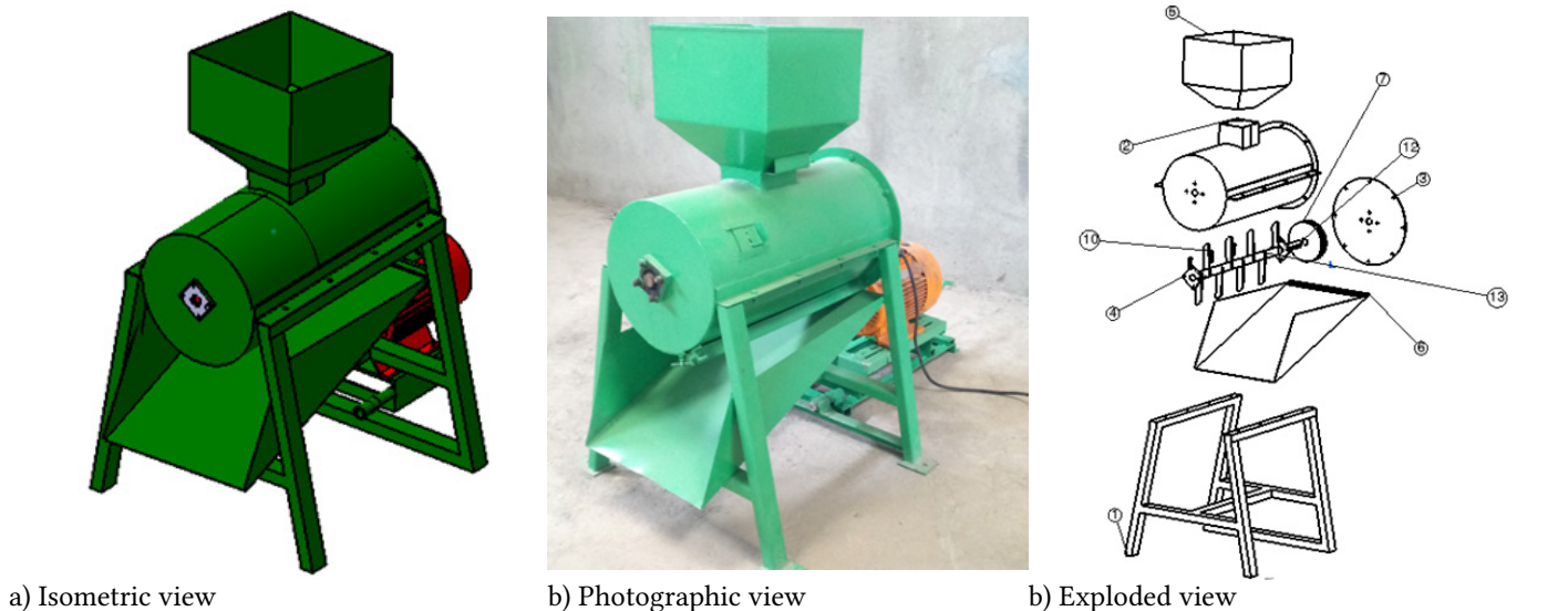
Figure 1. The developed de-huller machine (1. Frame, 2. Cylinder, 3. Side plate, 4. Flange bearing, 5. Hopper, 6. Outlet plate, 7. Pulley)

So by performing subsequent calculation, 210 mm pulley diameter on shaft, 255 mm center distance between two pulleys, 1020 mm length of belt were obtained.